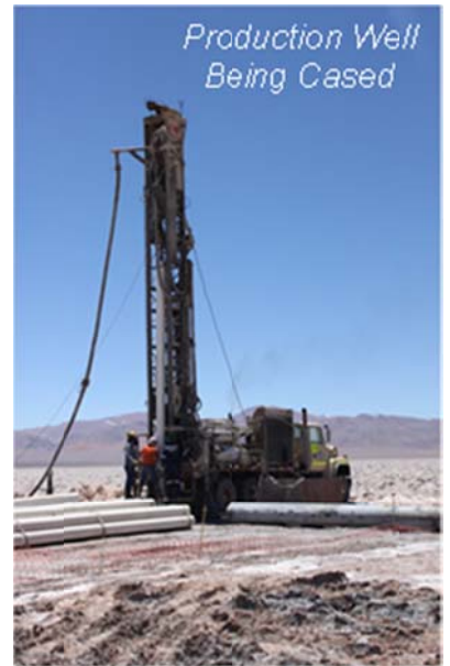
Production Well Being Cased

In closing, the turning of the calendar and the beginning of a new year coincides with the turning of the page for a new chapter in the history of Li3. Our goal is that this chapter will be characterized by the creation of sustainable shareholder value. We are grateful for the support of our shareholders, appreciative of the opportunity, respectful of the challenge, and committed to delivering on the outcome. On behalf of the entire Li3 management team and Board of Directors, we thank you again for your support; we look forward to the New Year as we continue our journey together.