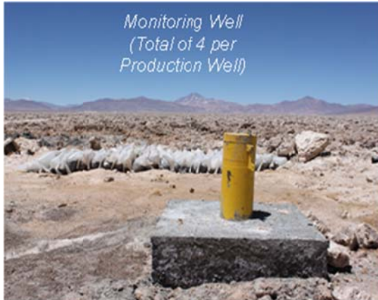
Monitoring Well (Total of 4 per Production Well)

The global capital markets experienced tremendous volatility in 2011 with numerous headwinds regarding global bank stability and viability, liquidity, political instability, global fiscal policy and uncertain economic growth. Despite this challenging environment, Li3 successfully closed several rounds of funding totaling $17+MM; completed the Maricunga project acquisition; established a significant strategic partnership and closed on an initial $8MM investment with POSCO, a leading international company; initiated its $8MM Phase One of the $18MM Exploration and Development Plan; selected and contacted leading lithium mining contractors (GAC, Boart Longyear, RC Rock Drilling); contracted a leading world recognized geologist as the Maricunga Projects Qualified Person